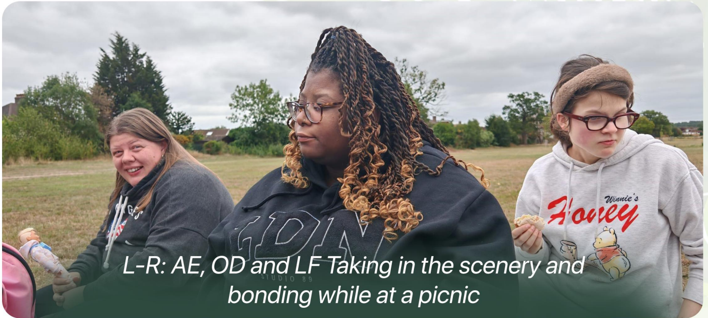
L-R: AE, OD and LF Taking in the scenery and bonding while at a picnic