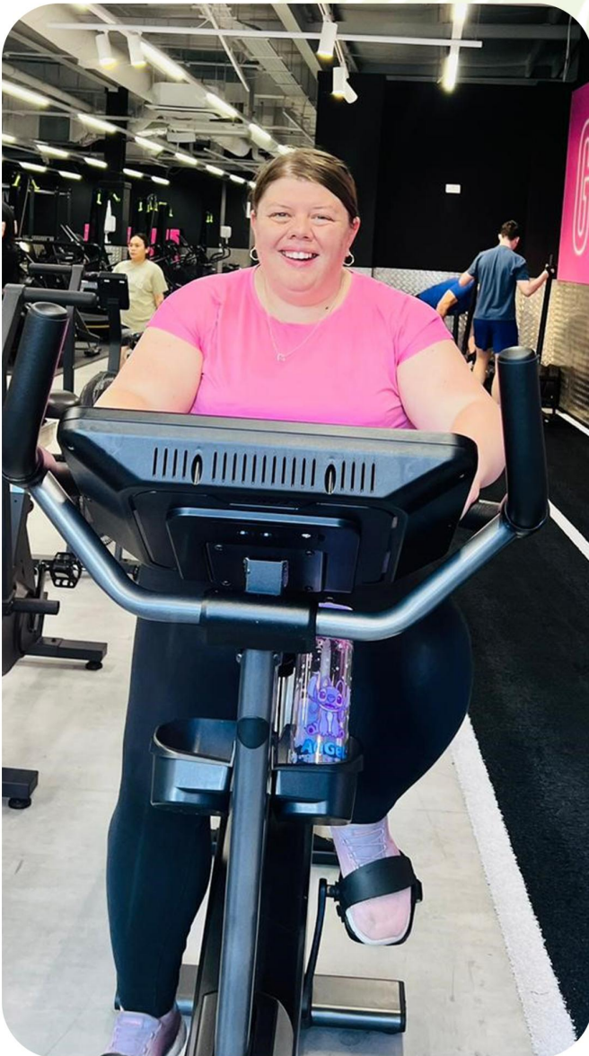
AE at the gym