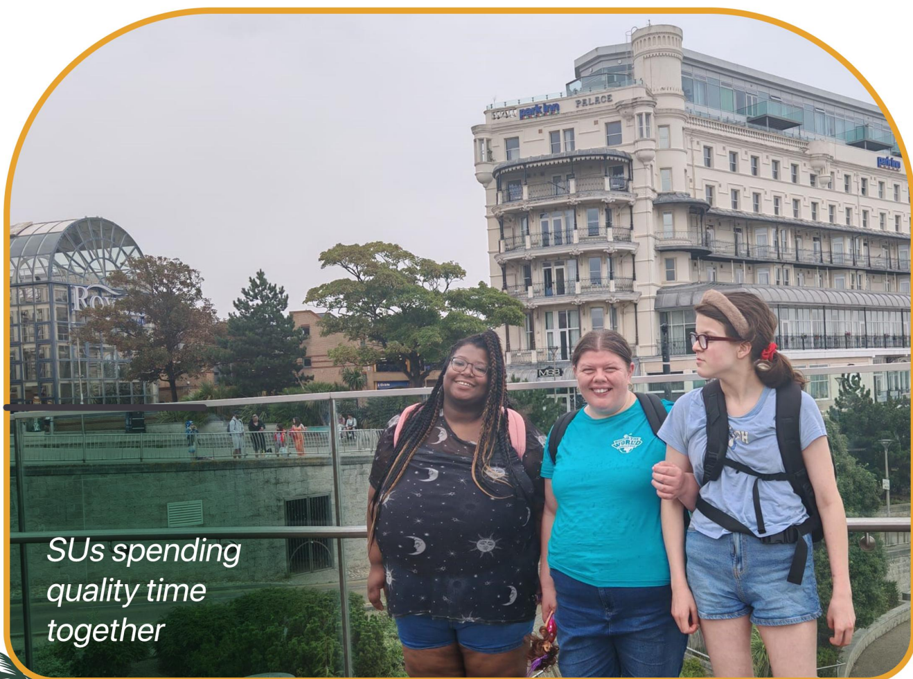
SUs spending quality time together