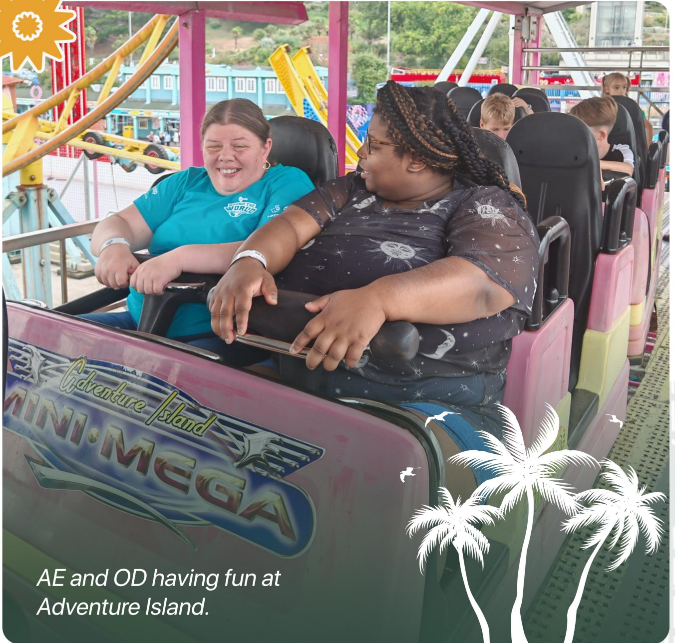
AE and OD having fun at Adventure Island.