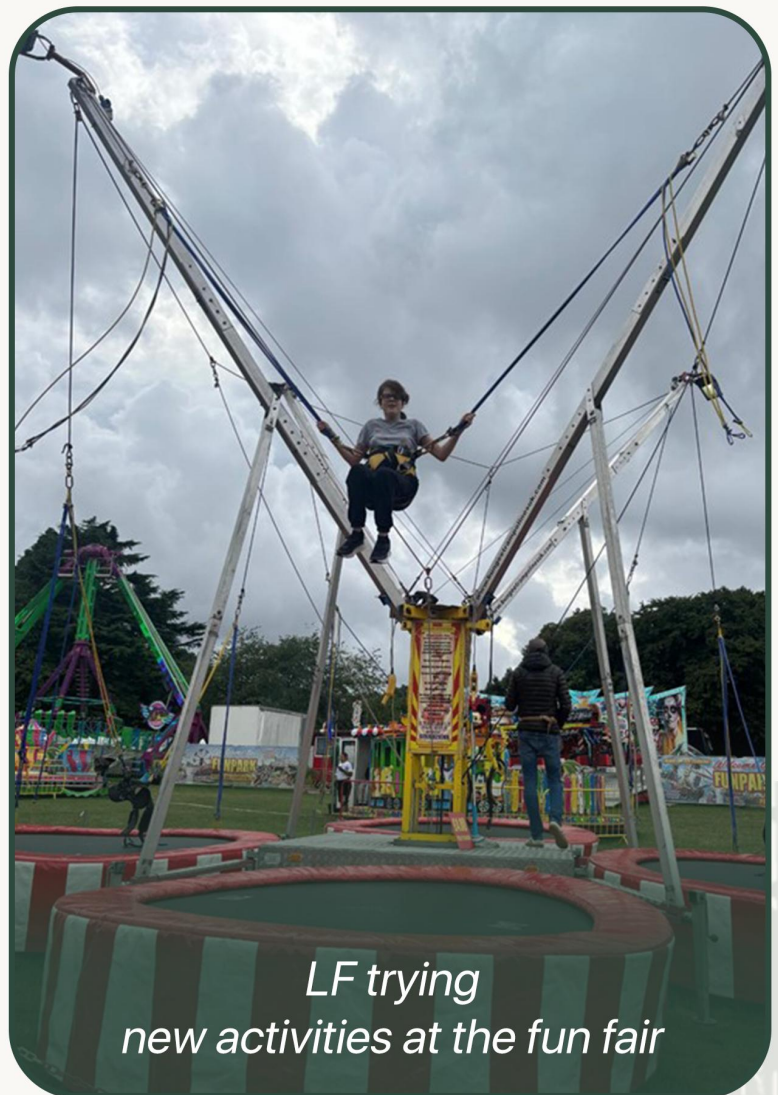
LF trying new activities at the fun fair