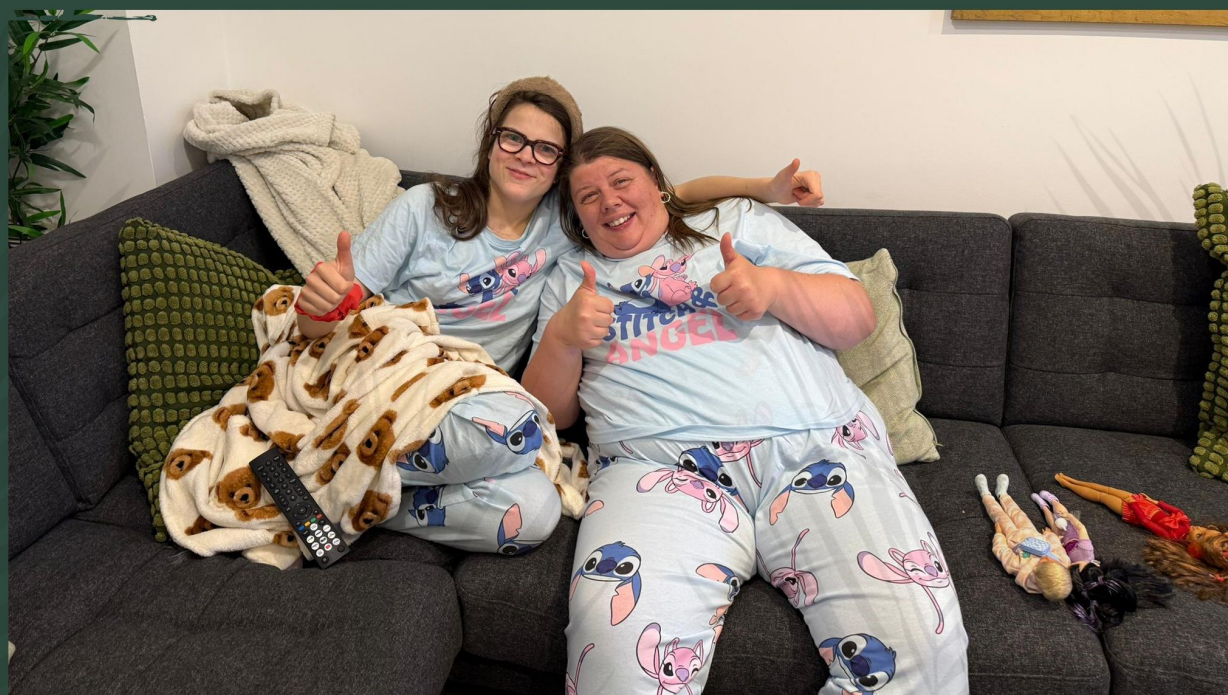
LF and AE hanging out