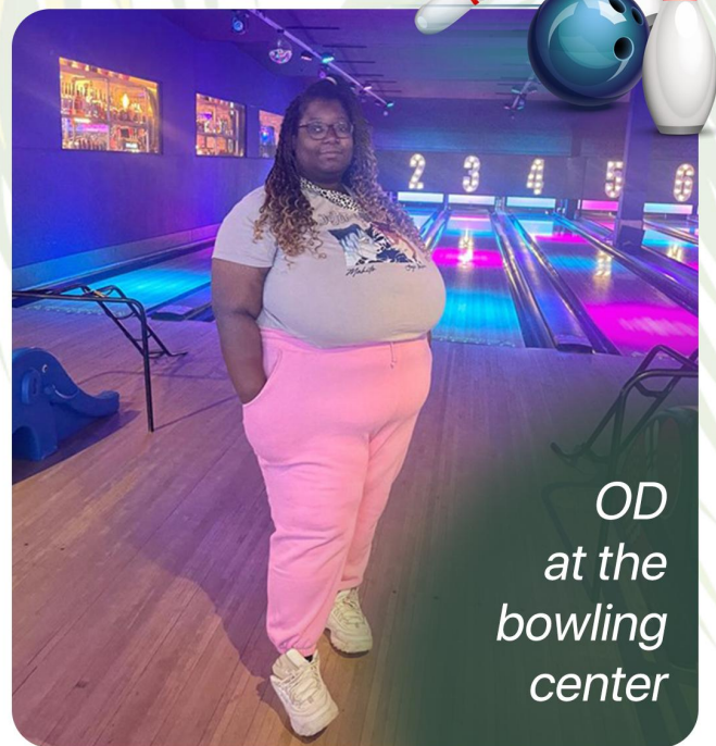
OD at the bowling center