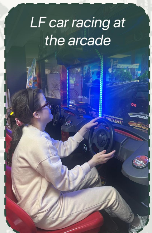
LF car racing at the arcade